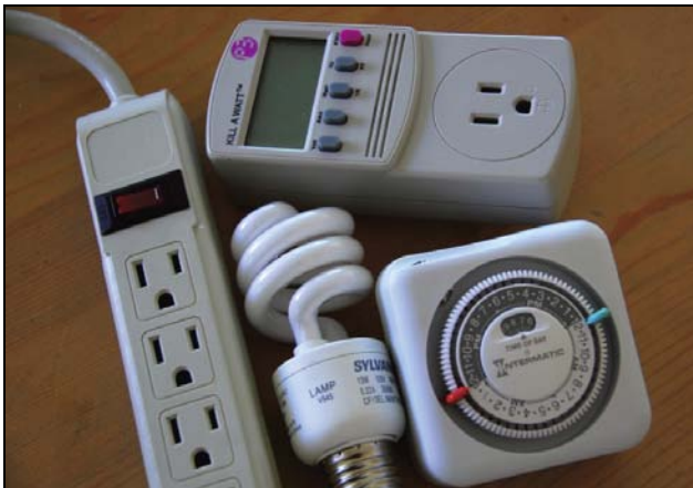
Photo shows Home energy saving and monitoring devices: compact fluorescent light bulb, power strip, timer, watt meter.

To summarize: (Amperes X Volts) / 1000 = kWh ("Watt" is often abbreviated "W").